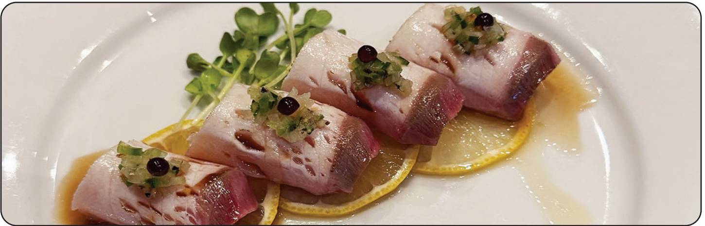
SEARED YELLOWTAIL SASHIMI 18.00