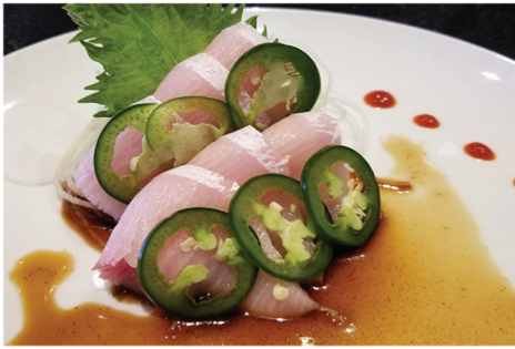
** YELLOW TAIL PONZU (6PC) 18.00