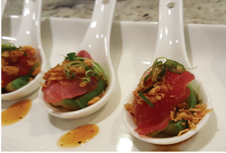
** TUNACADO (4PC) 16.00