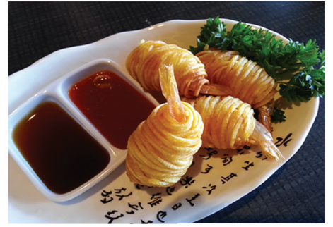
POTATO WRAP SHRIMP (4PC) 7.00