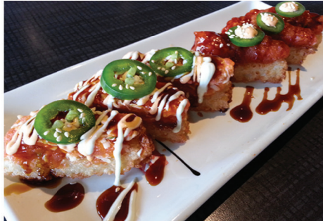
**CRISPY RICE (4PC) 10.00