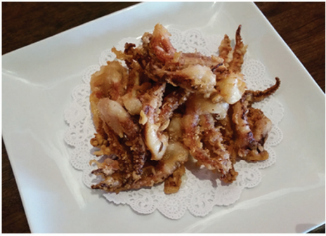
FRIED SQUID LEGS 7.00