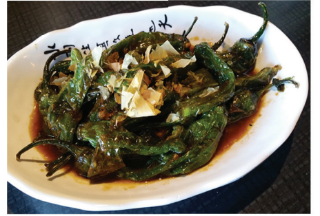
SHISHITO PEPPER 10.00