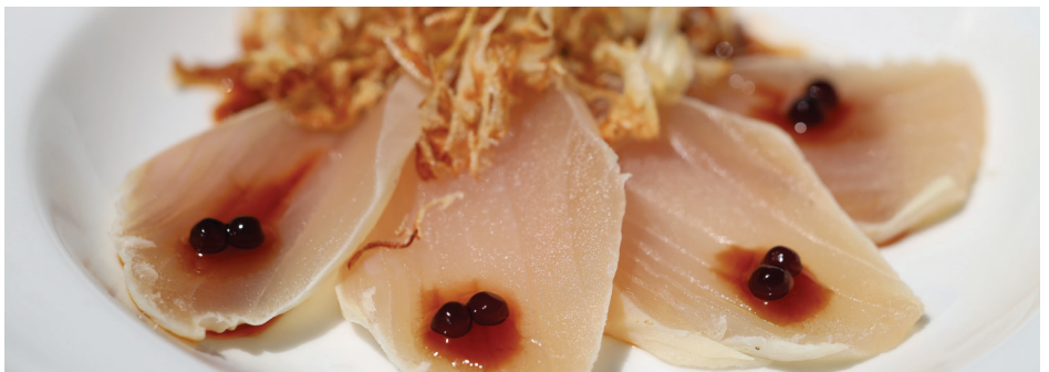
SEARED ALBACORE WITH GARLIC PONZU 15.00