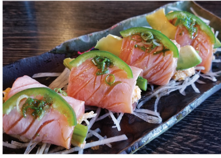
** SEARED SALMON WRAP (4pc) 15.00